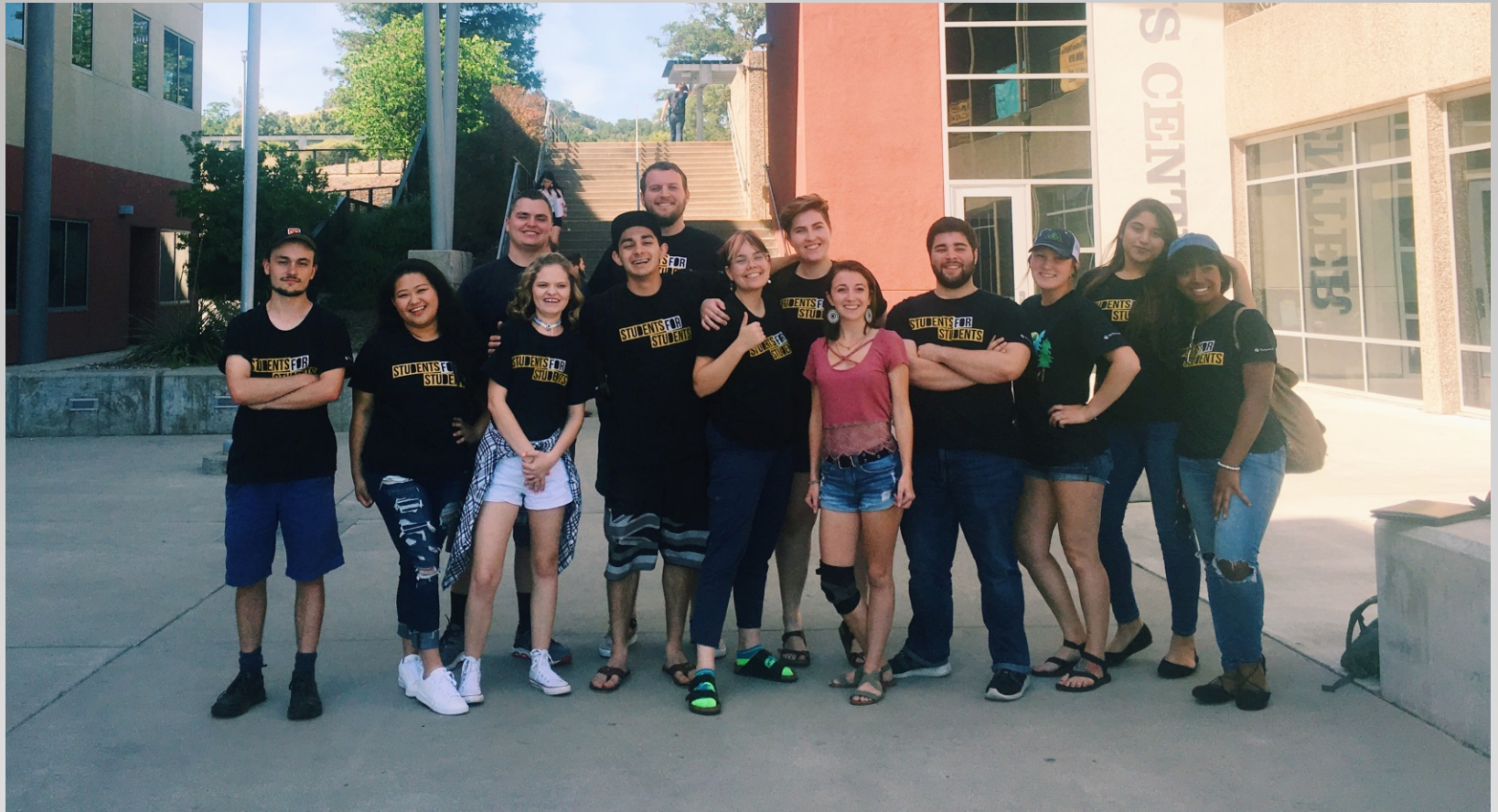
2016-2017 AS Officers